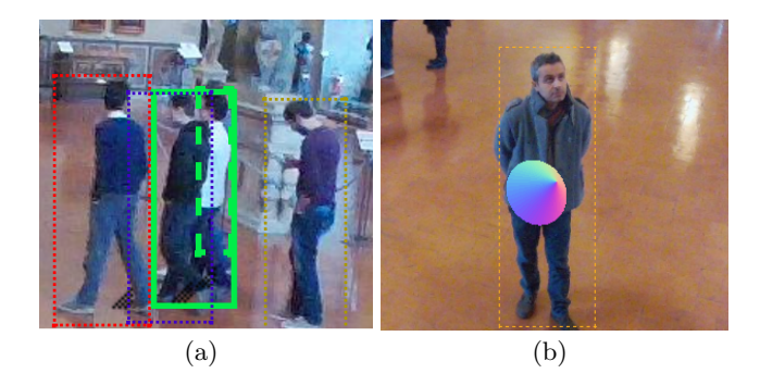
Figure 3: (a) The solid green rectangle represent the bounding box selected for the annotation while the green dashed rectangle represent the visible (not occluded) area annotated by the user; (b) The cone visualizes the annotation of the gaze provided by the user.

Figure 2: Add person view. Annotators can add a new identity or select from a one previously inserted.